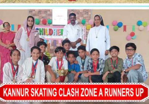
KANNUR SKATING CLASH ZONE A RUNNERS UP