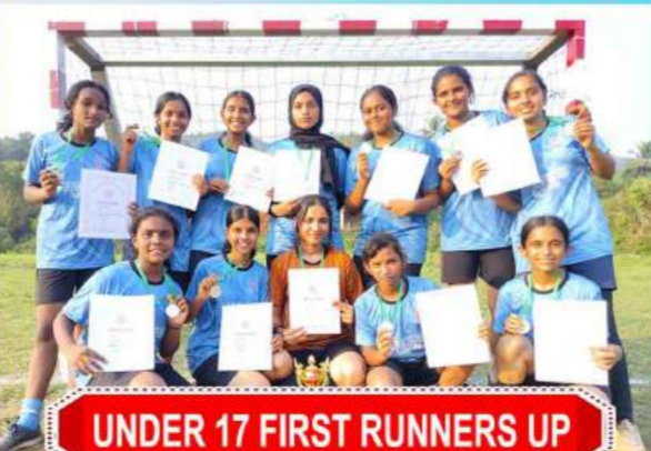
UNDER 17 FIRST RUNNERS UP