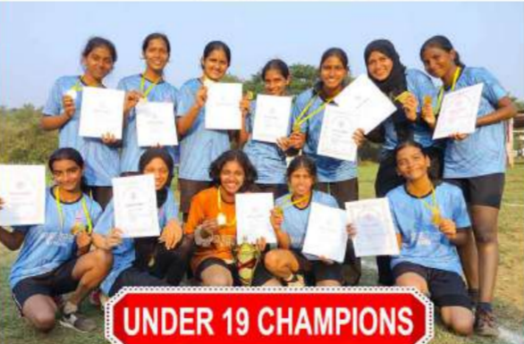
UNDER 19 CHAMPIONS