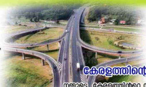
Malha Merryn 5 B

Within these walls where knowledge gleams, A school of learning shapes our dreams. Not sterile halls, but vibrant space, Where minds ignite and find their place. The teachers guide with patient hands, Through lessons vast from many lands. With history's tales and science's art, They open minds and touch the heart. No rigid paths but open doors, To explore the world and so much more. Creativity takes flight and soars, As imagination freely roars. A school of learning-more than a name, A beacon bright, a guiding flame. Where wisdom's fire is kindled deep, And knowledge treasures we will keep. So let us learn and let us grow, Within these walls, let our spirits glow. A school of learning, true and bold, A story waiting to unfold.