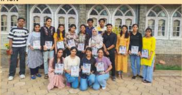
HAND BALL GIRLS - IIIrd PRIZE