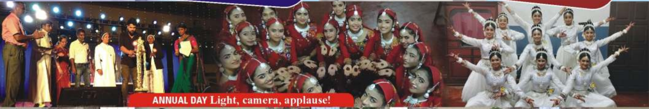
ANNUAL DAY Light, camera, applause!

At Sanjos, our vision is to cultivate an educational environment that goes beyond textbooks and classrooms. We strive to nurture minds, fuel intellects, invigorate bodies, and ignite souls. Our commitment is to empower students with an education that not only enriches their knowledge but also fosters holistic growth. We believe in inspiring a journey of learning that extends far beyond academic achievement, aiming to create individuals who are not just knowledgeable but also compassionate, innovative, and resilient members of society.