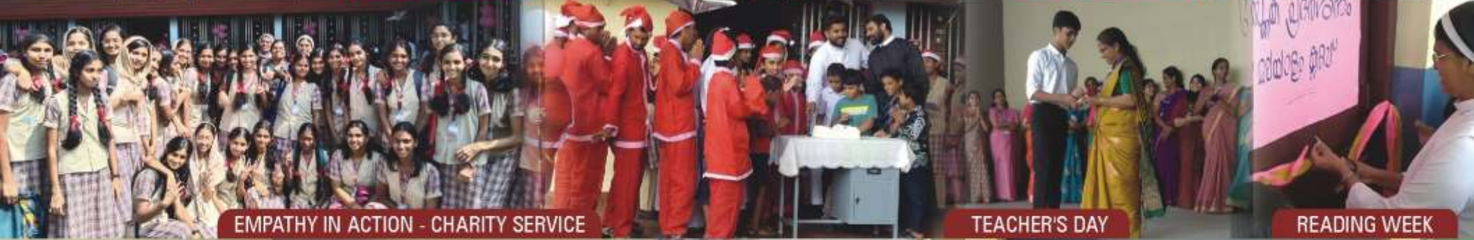
EMPATHY IN ACTION - CHARITY SERVICE